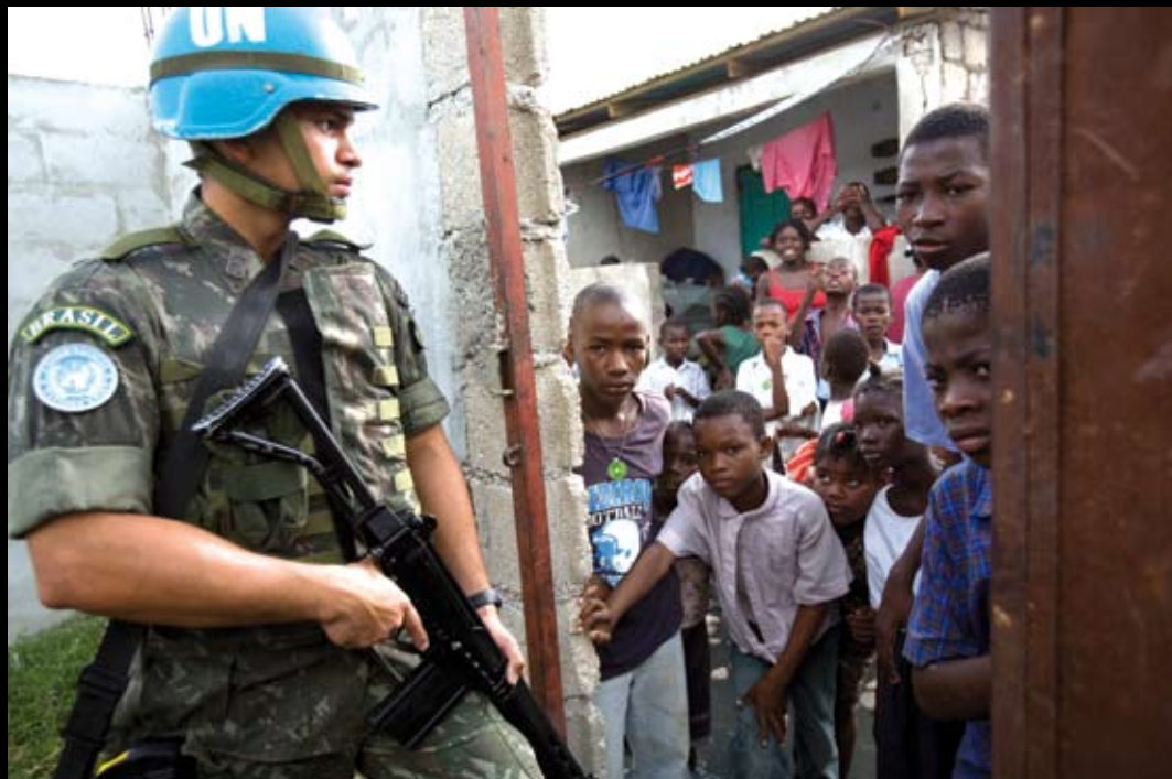
A peacekeeper stands guard as children wait outside a school in Cité-Soleil, Port-au-Prince, Haiti