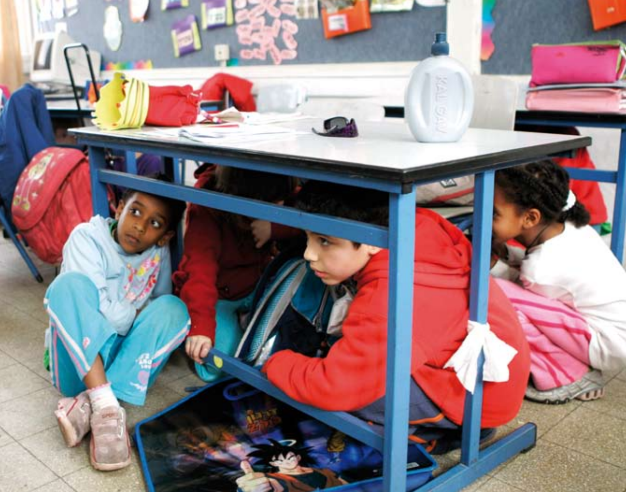
Israeli first grade students practise an emergency drill in case of rocket attacks on their school in Ashkelon

education institutions; and to monitor efforts to end impunity for all attacks. The international community calls on the UN Security Council to support such efforts, as a means of encouraging further action to prevent attacks on education.