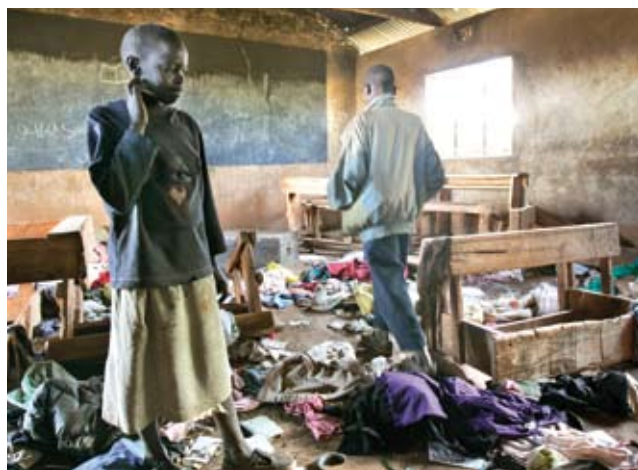
A Kenyan school damaged in post-election violence

and adults to a safe education in a peaceful learning environment, and to respect education institutions as safe sanctuaries. To this end it urges the United Nations Security Council to commission the creation of an international symbol for use on education buildings and education transport facilities to encourage recognition that they should be treated as safe sanctuaries and should not be targeted.