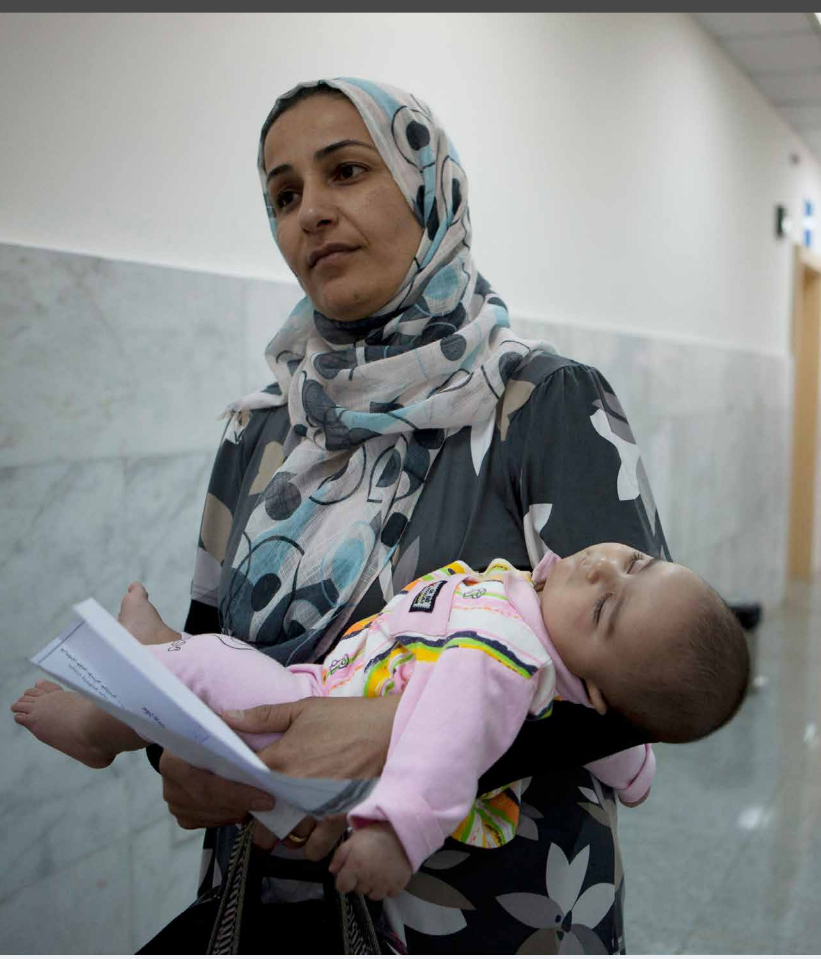
A mother and her child at the Halabja Maternity and Child Hospital, Iraq.