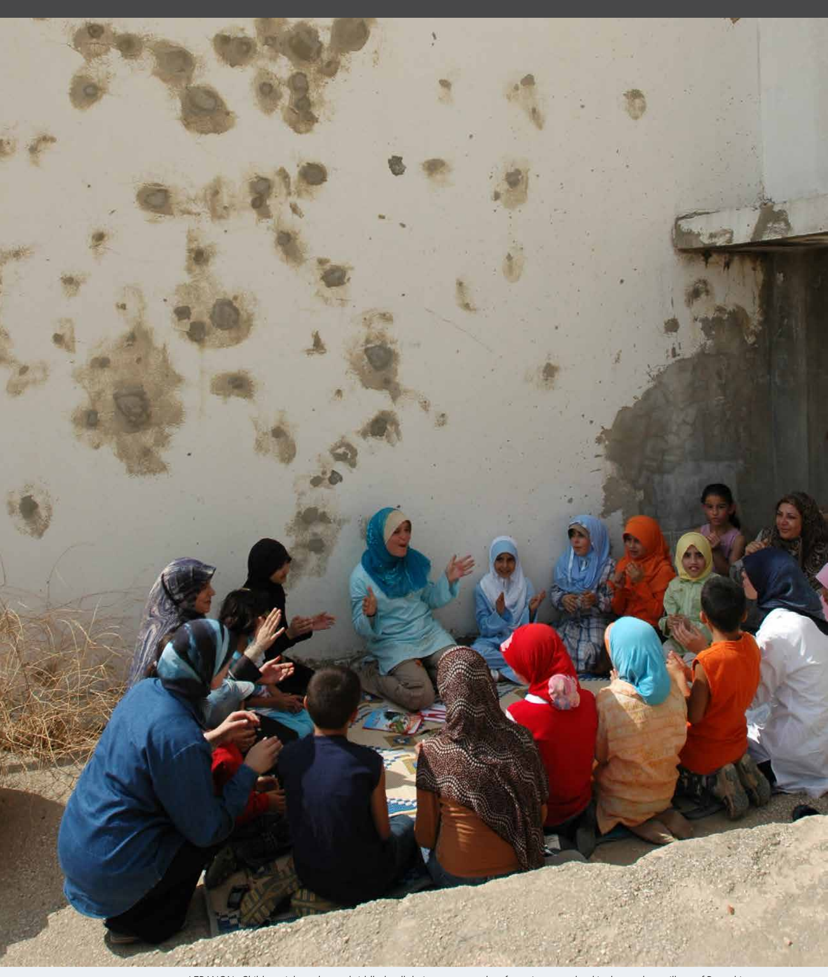
LEBANON: Children sit by a shrapnel-riddled wall during an arts-and-craft session at a school in the southern village of Barrachit. UNICEF/HQ07-0795/NICOLEB TOUTOUN.