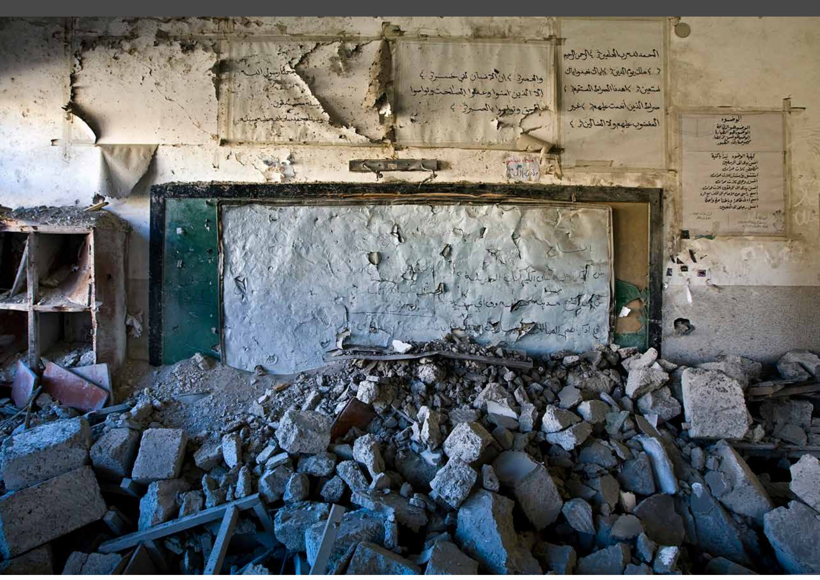
Blackboard in school damaged by attack in Sirte, Libya.