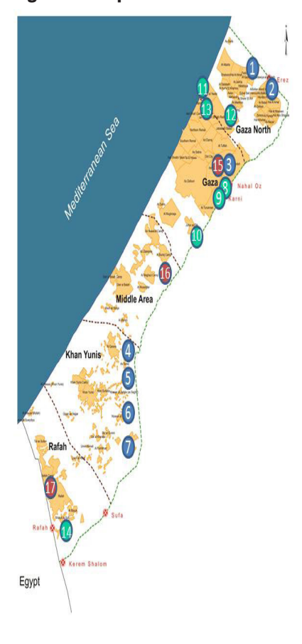
Figure 1. Map of school locations