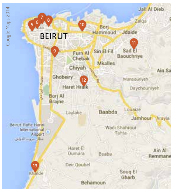
Maps of Lebanon and Beirut with universities where Syrian students interviewed were studying.