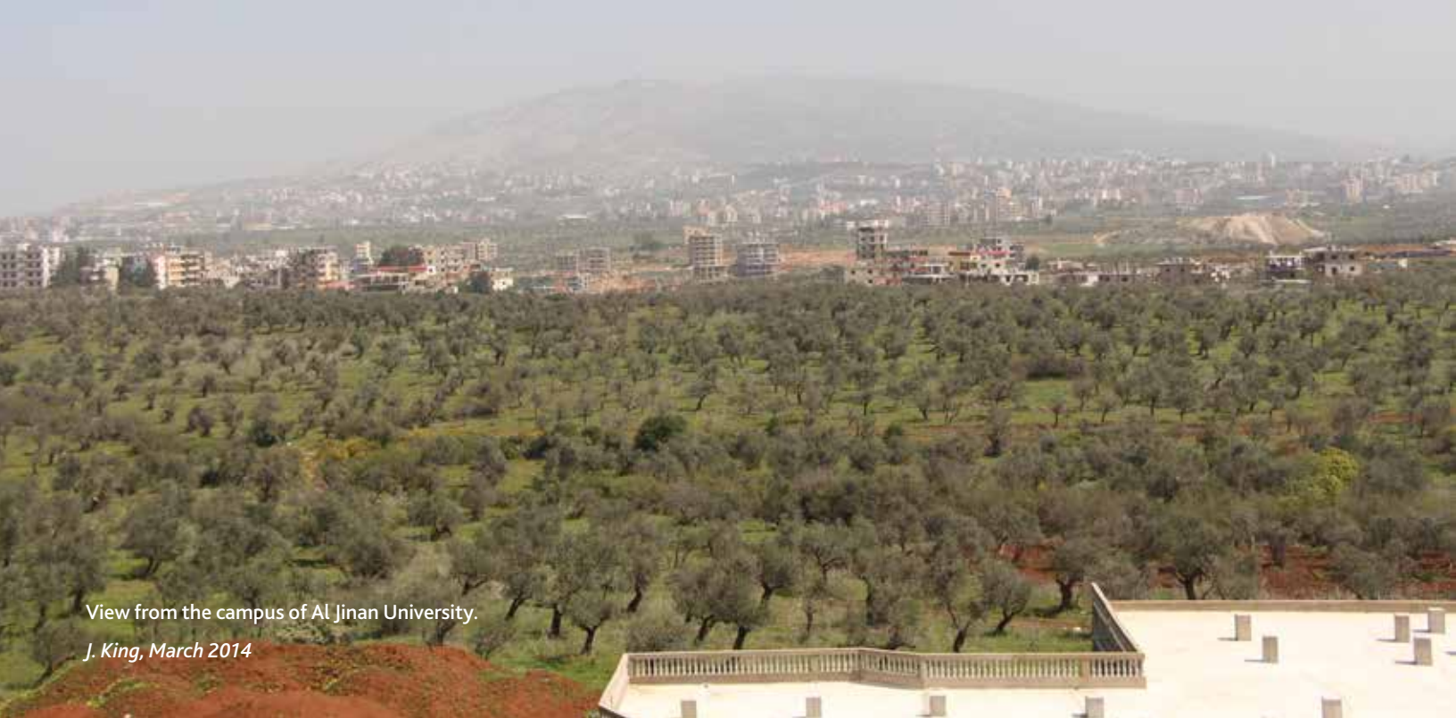
View from the campus of Al Jinan University.