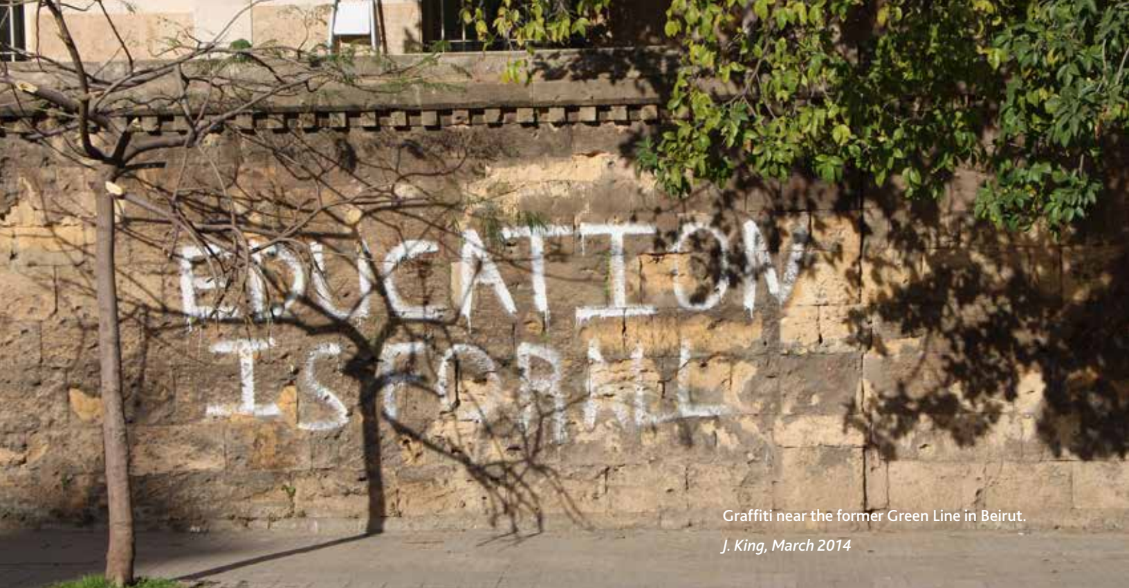
Graffiti near the former Green Line in Beirut.

the Lebanese education sector, the organization could serve as an effective link between international NGOs and donors, Syrian university students, and Lebanese universities. In addition, it has the advantage of being largely perceived by Syrians as non-sectarian, as its staff and volunteers come from a variety of Syrian cities, religions, and ethnic groups, and includes Lebanese and non-Syrians as well.