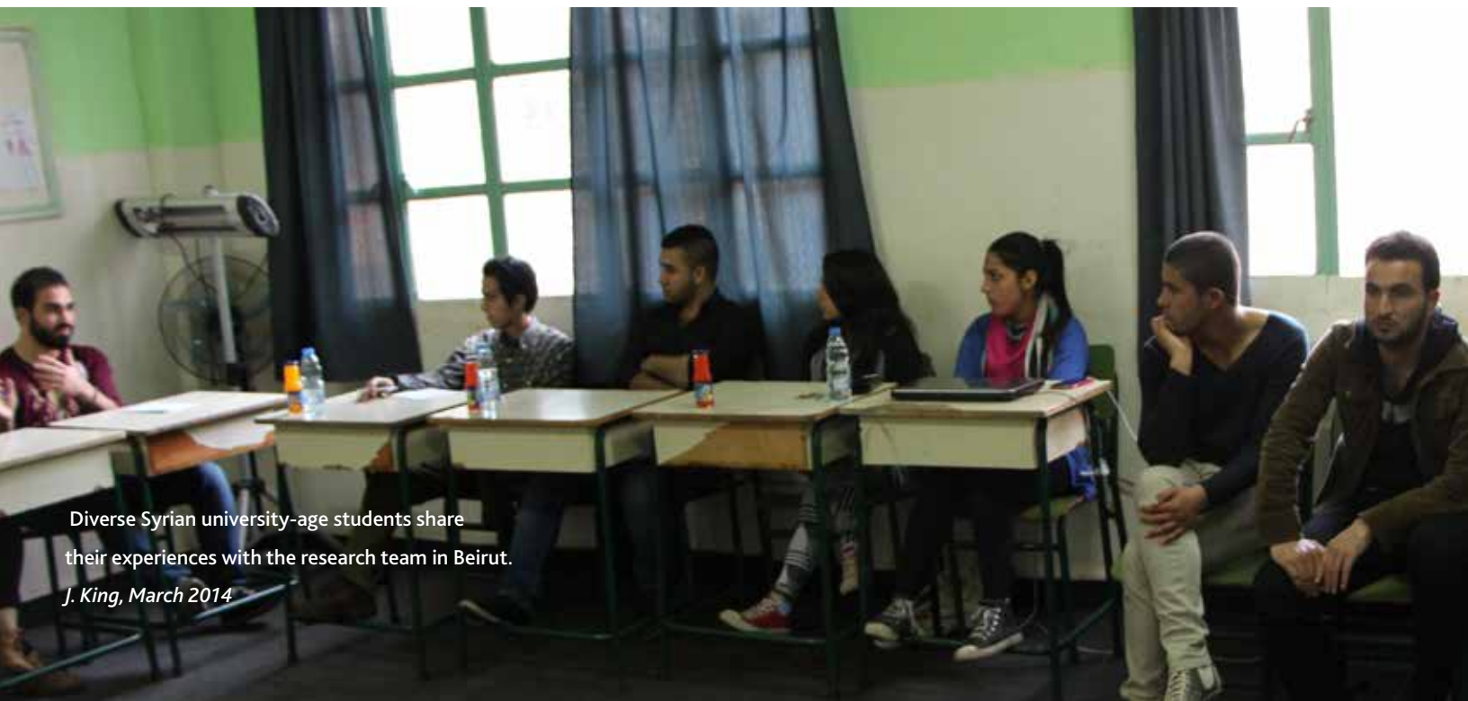
Diverse Syrian university-age students share their experiences with the research team in Beirut.

In Tripoli, we interviewed a group of three very serious graduate students from who were working toward Master’s degrees with the support of IHR. Two of the young men, from the embattled towns in Northern Syria, were studying