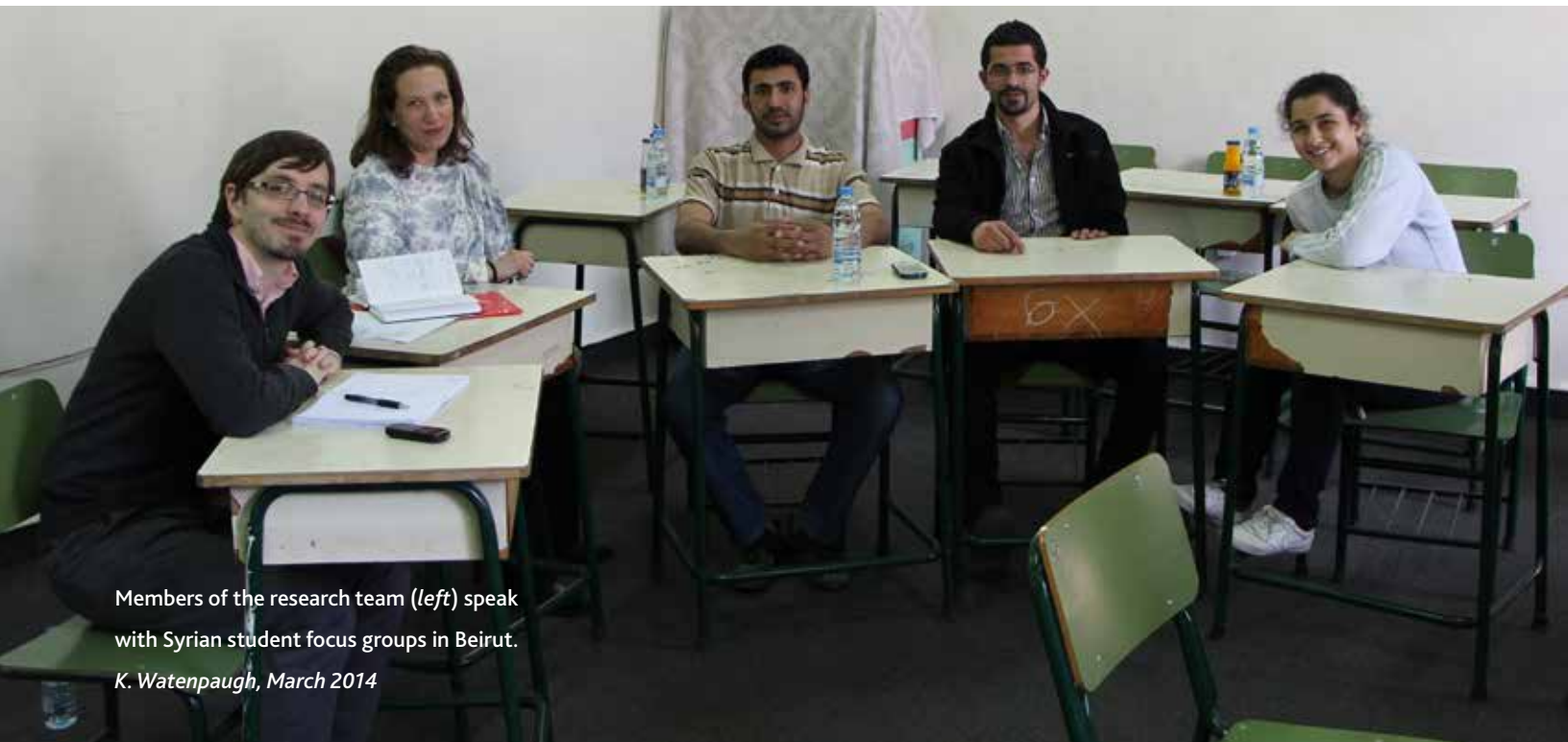
Members of the research team (left) speak with Syrian student focus groups in Beirut.

As in our 2013 research in Jordan, we identified and met with three broad categories of displaced Syrian university students from among the university-age Syrians in Lebanon: students with means; urban students at risk; and informal camp-based students. The team also met with a number of well-off Syrian young people whose families were living outside of Syria in countries like the United Arab Emirates or the United States. These students did not identify as displaced, and they experienced relatively less fear and loss than their peers.