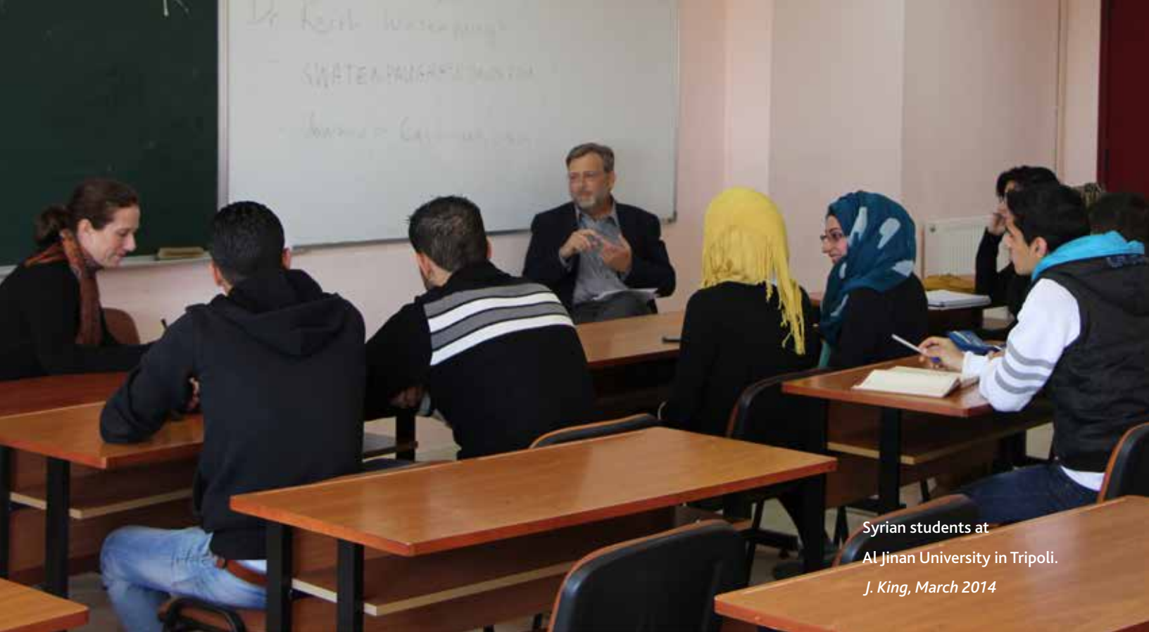
Syrian students at Al Jinan University in Tripoli.