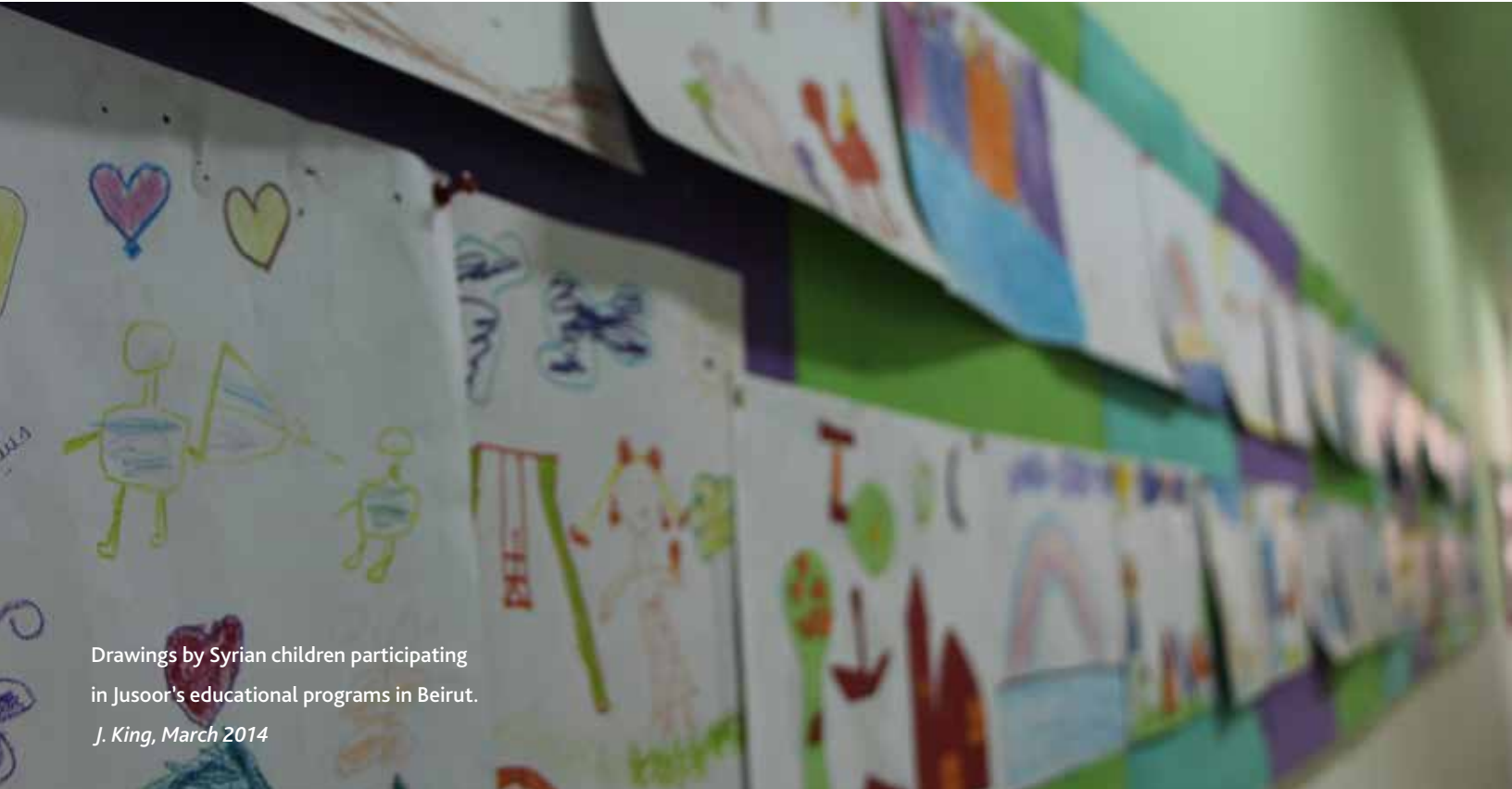
Drawings by Syrian children participating in Jusoor's educational programs in Beirut.