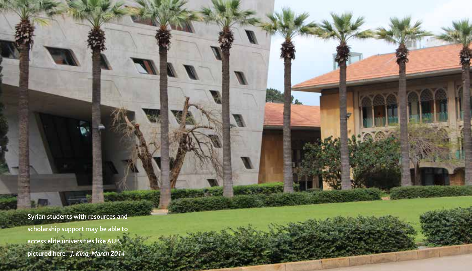
Syrian students with resources and scholarship support may be able to access elite universities like AUB, pictured here.

NGO partners. Resettlement of RSD applicants is contingent on third countries making spaces available, and few Syrian registrants have been able to benefit from this mechanism. 28