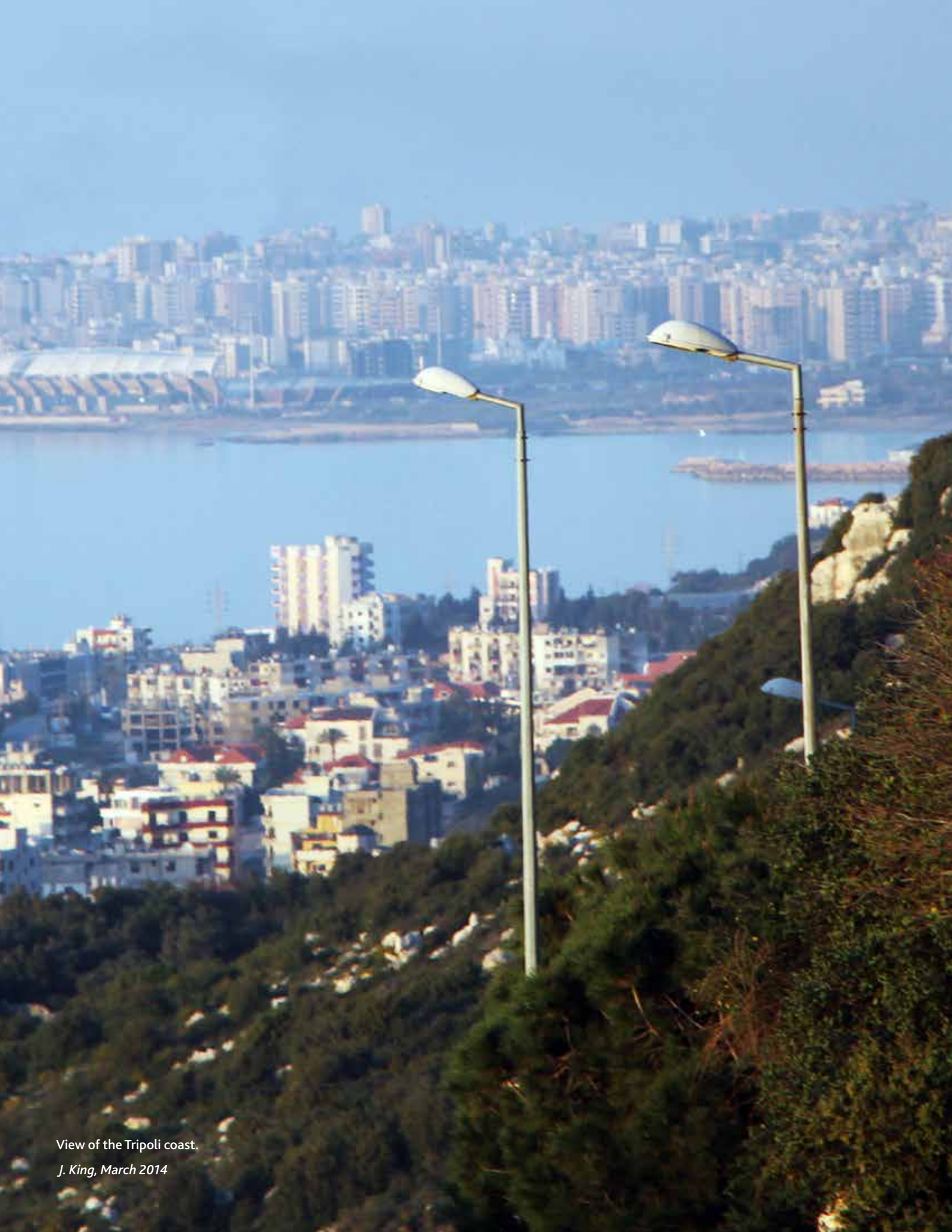
View of the Tripoli coast.