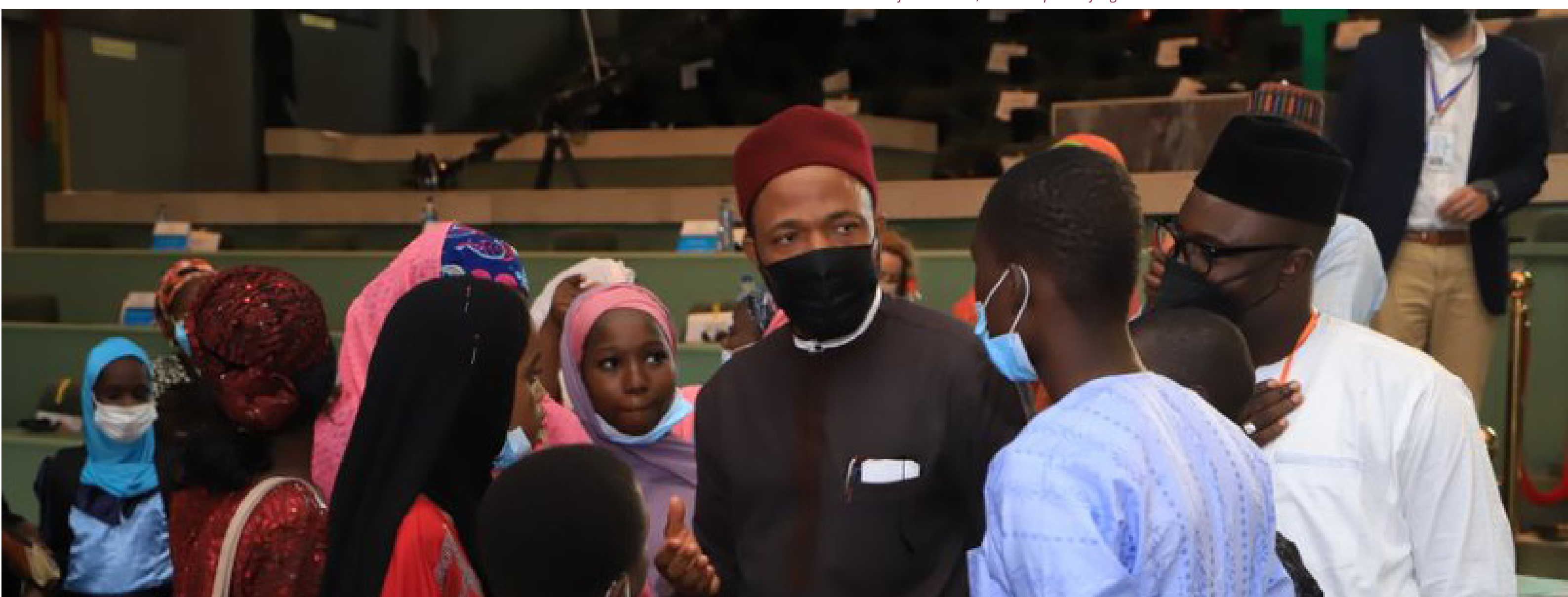
Photo: Borno State Children's Parliament engaging with H.E. Mr. Chukwuemeka Nwajiuba, Minister of State for Education, Federal Republic of Nigeria.

Children from Burkina Faso, Colombia, Guatemala and Palestine, presented a statement from the Children's Manifesto, Leading up to the Abuja Conference, Save the Children consulted with 300 children in ten countries, including Nigeria, Ukraine, Colombia and Yemen, on what education means to them, what impact the SSD has had, and what recommendations they would give global leaders. The consultations resulted in a Children's Manifesto, written by the children themselves, outlining the risks they are exposed to in and around schools, and offering 11 concrete recommendations (included in the recommendations section of this report) and several calls to action.