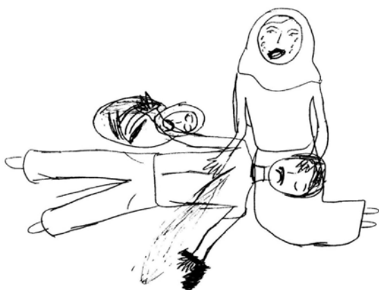
Drawings by Syrian refugee children

There are also reports that early marriage of young girls is increasing. This can be understood as desperate families like Um Ali's struggling with ever-narrowing options to survive. They may be trying to reduce the number of mouths they have to feed or hoping that a husband will be able to provide greater security for their daughter from the threat of sexual violence. However, anecdotal reports from organisations working inside Syria indicate that early marriage is sometimes being used as a 'cover' for sexual exploitation, where girls are divorced after a short time and sent back to their families. 53 In such a chaotic and dangerous environment, children and young girls in particular are at much greater risk of abduction and trafficking, especially for purposes of sexual exploitation.