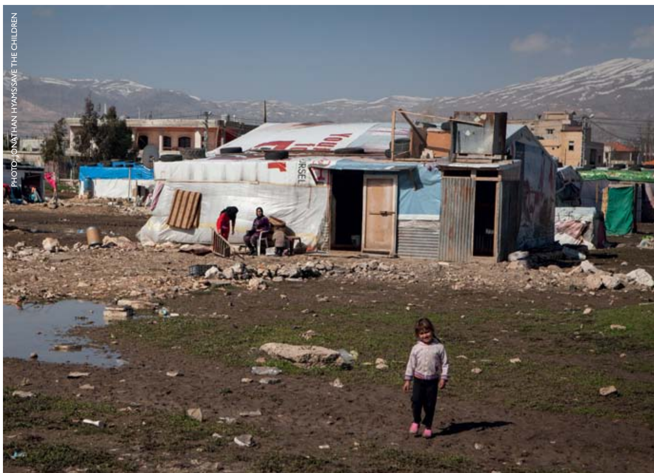
A refugee settlement near the Syrian border

Save the Children is working with UNHCR and other UN agencies, and the host governments in Jordan, Lebanon, and Iraq, to ensure that all vulnerable groups get the assistance and protection they need. We are providing support to refugees (whether registered or unregistered) and host communities, as well as non-Syrians fleeing the country, such as Palestinians and Iraqis. As of March 2013, we had provided much-needed assistance to more than 240,000 people across the region, including shelter, food, and protection for children.