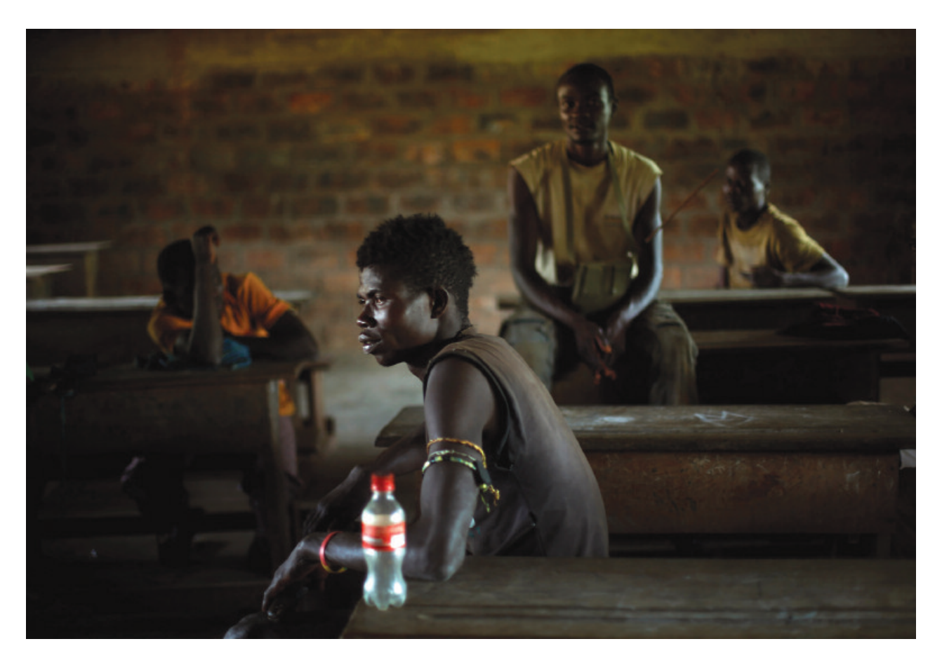
Former FARCA (Central African Republic Forces) soldiers linked to Anti-Balaka Christian militiamen sitting in a school set up as a camp in Bangui, Central African Republic, on December 15, 2013.

cacy or conditions for protecting schools from military use is simply less effective.