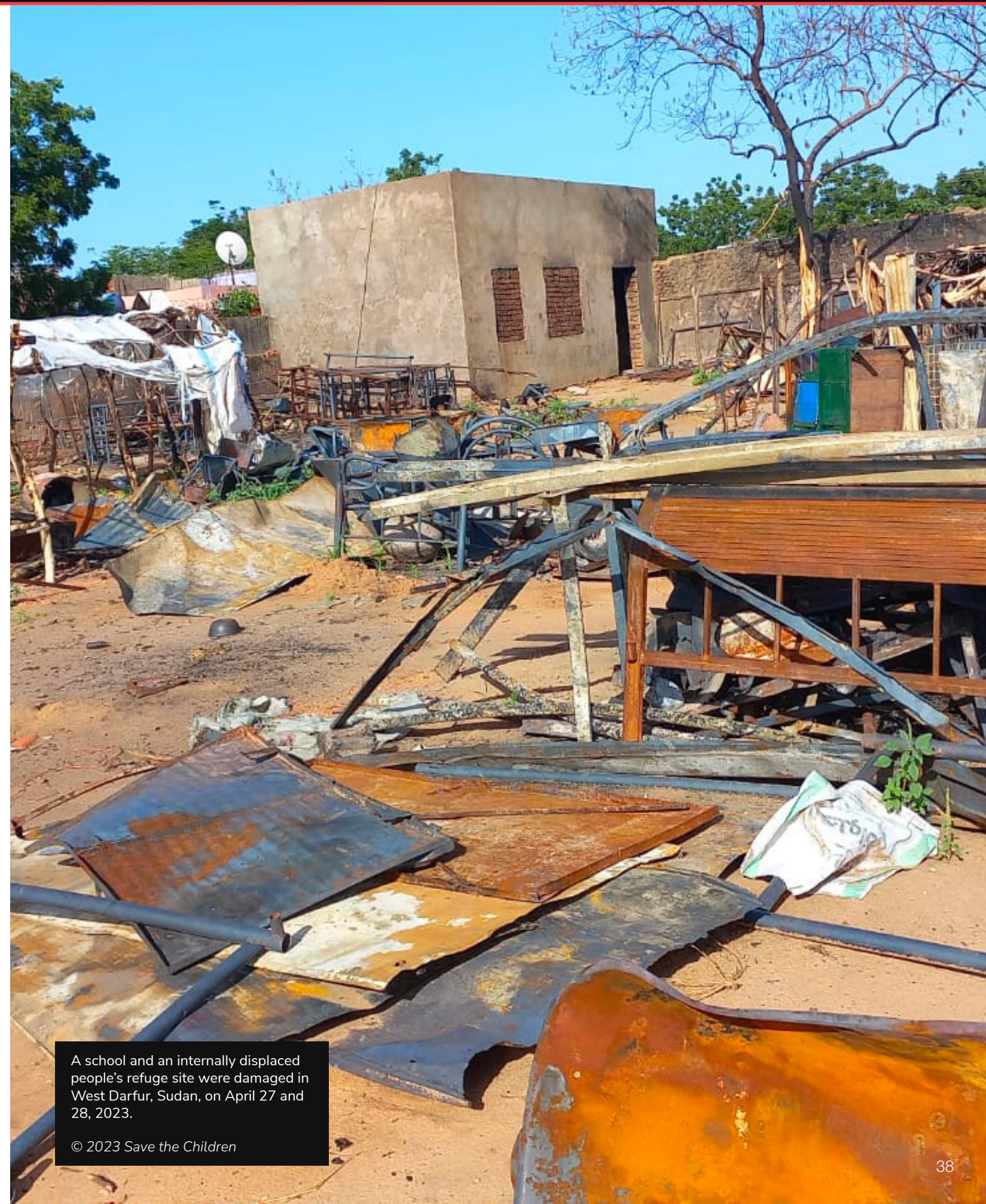
A school and an internally displaced people's refuge site were damaged in West Darfur, Sudan, on April 27 and 28, 2023.

In yet other contexts, military use of schools or universities provoked rival armed forces or groups to target the educational facility. In 2022 and 2023, state military, police, and non-state armed groups used schools and universities for tactical purposes, for example as bases, barracks, fighting positions, or as detention or interrogation centers. GCPEA identified military use preceding attacks on educational facilities by rival forces or groups in a number of countries, including Colombia, Ethiopia, Iraq, Myanmar, Syria, Egypt, and Ukraine .