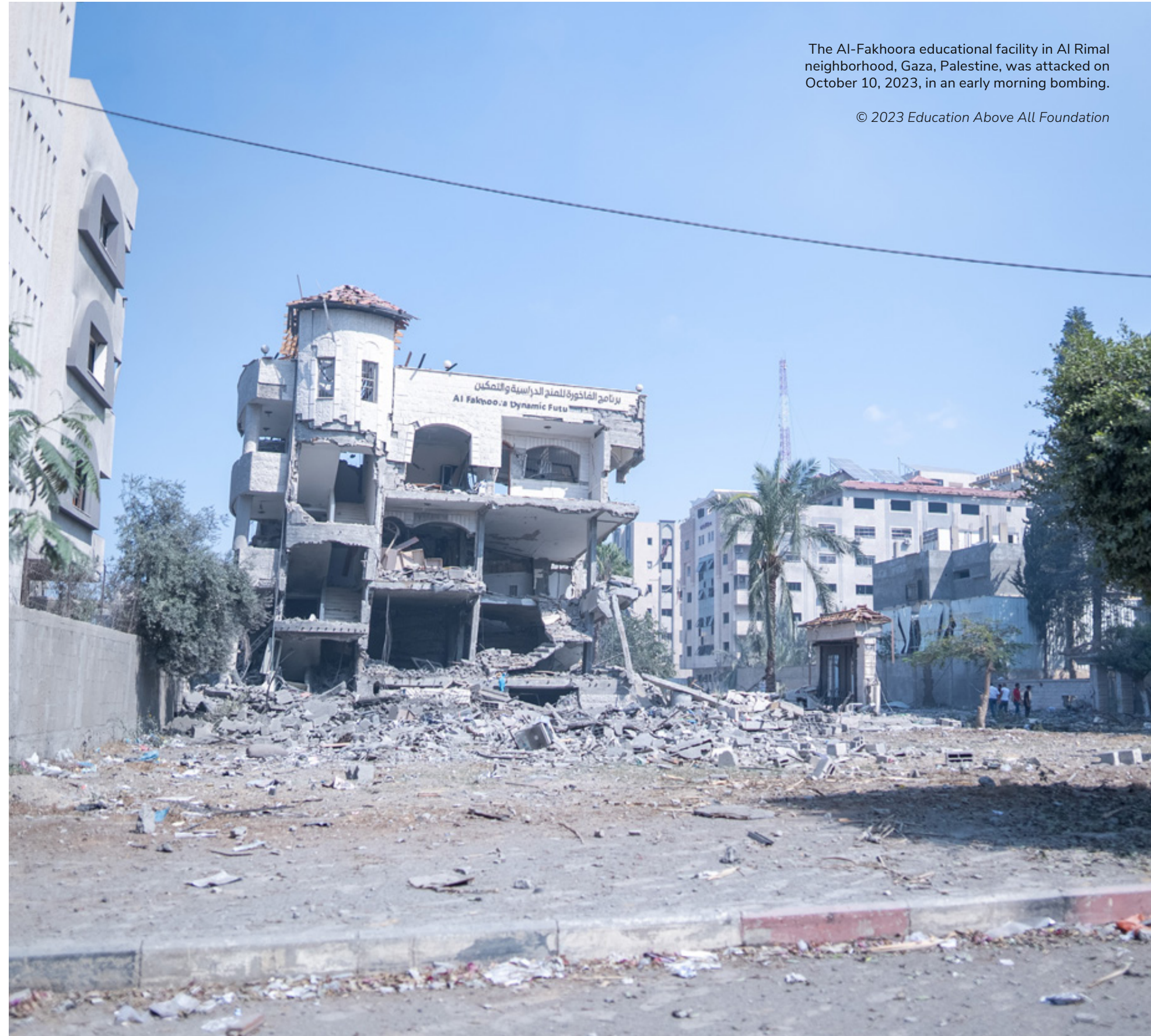
The Al-Fakhoora educational facility in Al Rimal neighborhood, Gaza, Palestine, was attacked on October 10, 2023, in an early morning bombing.

The Education under Attack 2024 report profiles the 28 countries in armed conflict that were most affected by attacks on education in 2022 and 2023. Although attacks on education increased globally during this reporting period, complex conflict dynamics occurred between and within countries, with rates of attacks rising in some places alongside declines elsewhere. The Global Overview and country profiles provide background on the contextual factors driving these attacks, along with annual trends and incident reports.