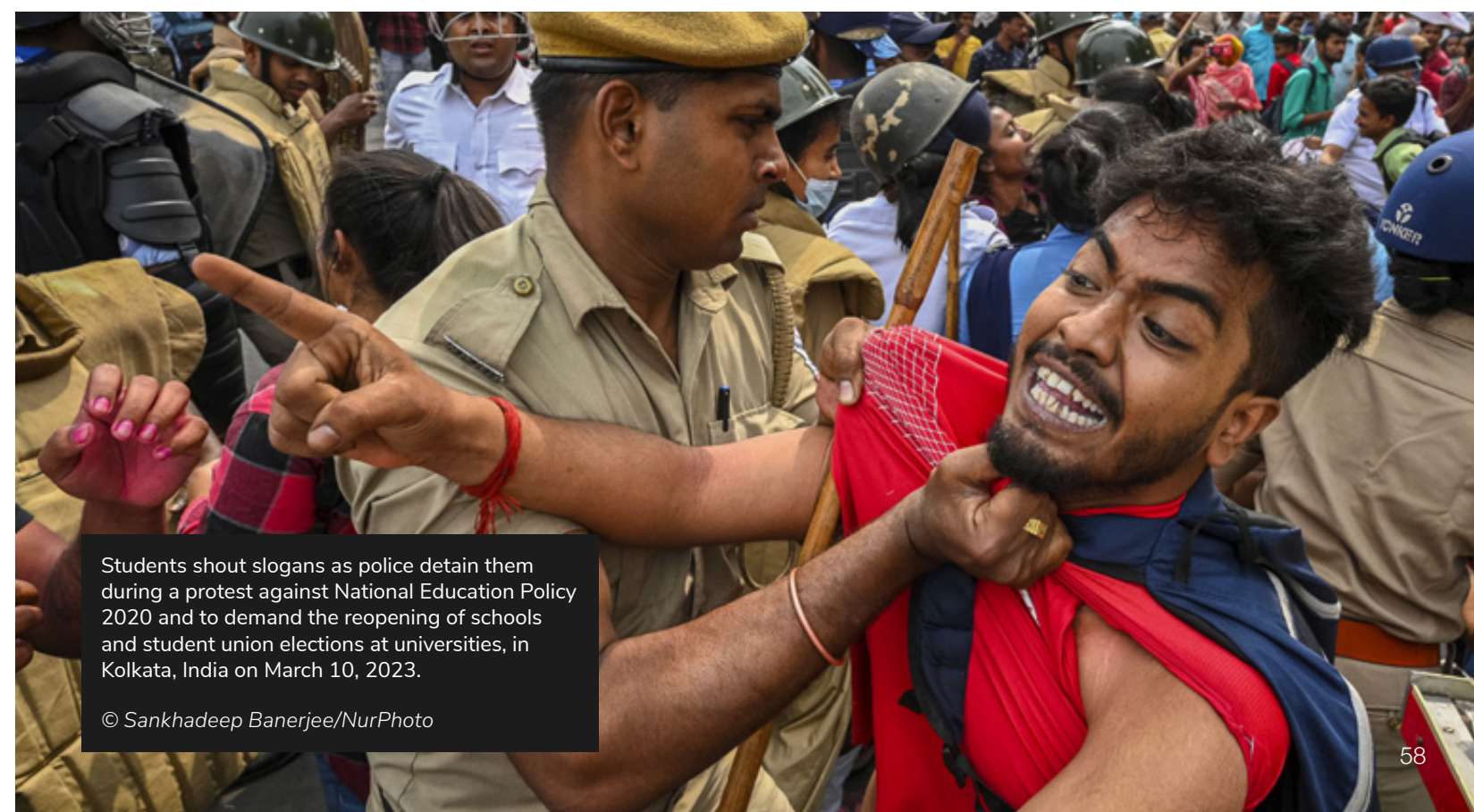
Students shout slogans as police detain them during a protest against National Education Policy 2020 and to demand the reopening of schools and student union elections at universities, in Kolkata, India on March 10, 2023.