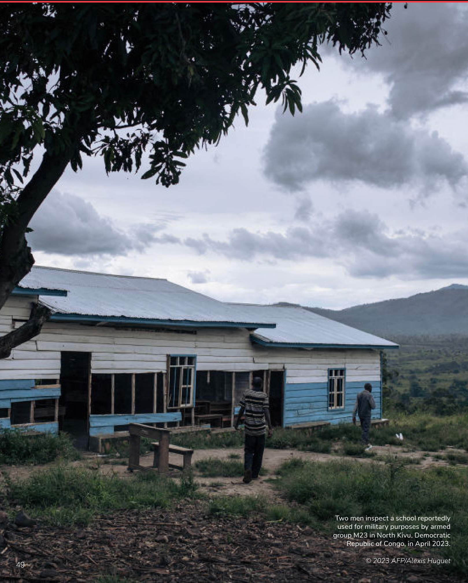
Two men inspect a school reportedly used for military purposes by armed group M23 in North Kivu, Democratic Republic of Congo, in April 2023.