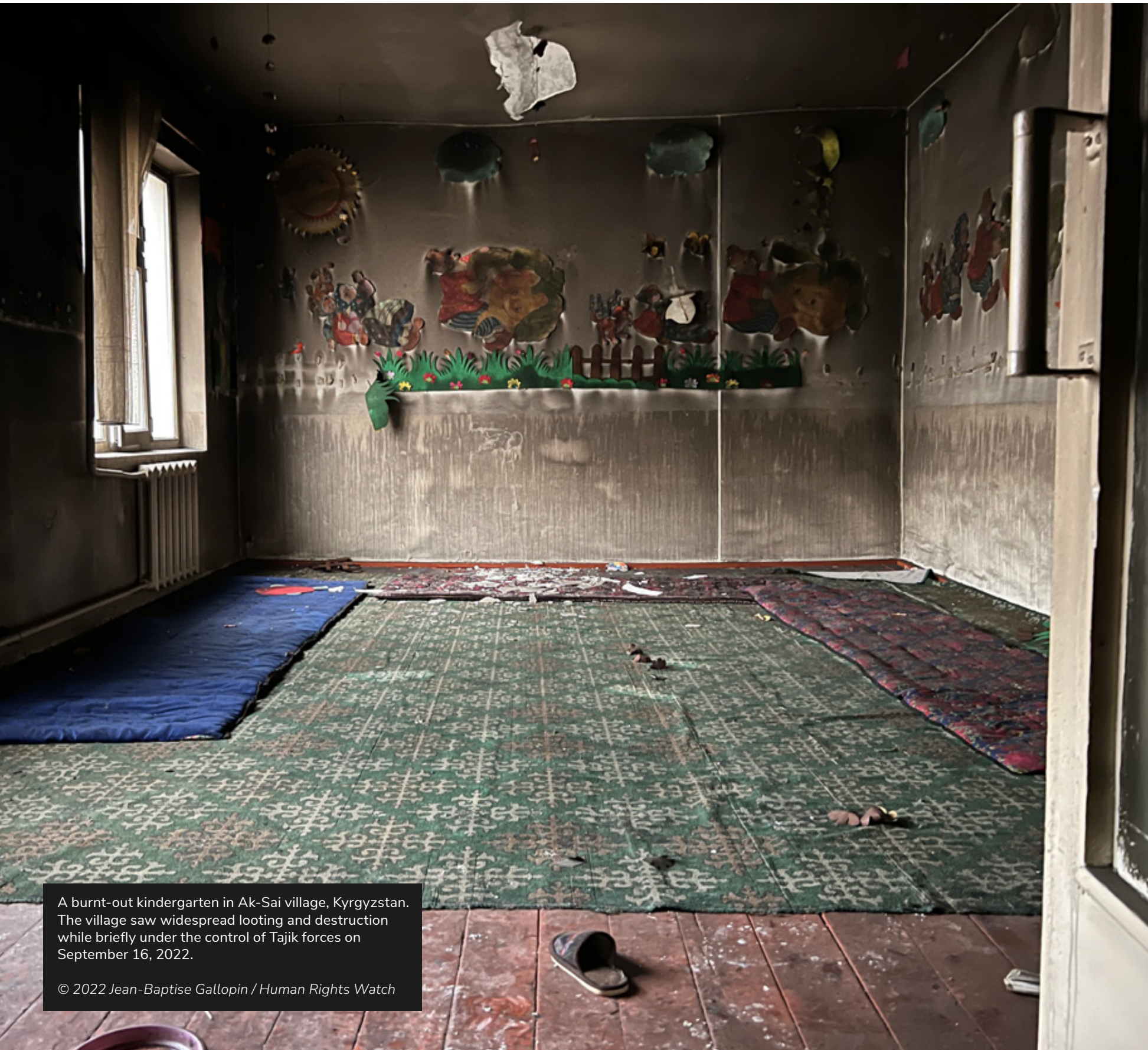
A burnt-out kindergarten in Ak-Sai village, Kyrgyzstan. The village saw widespread looting and destruction while briefly under the control of Tajik forces on September 16, 2022.