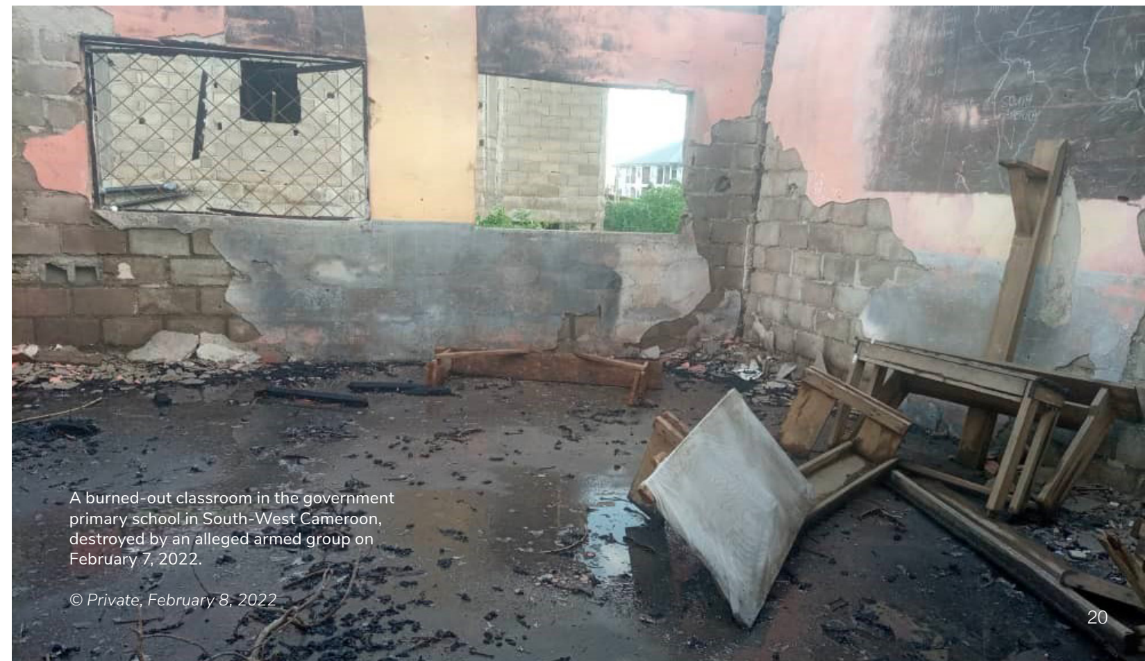
A burned-out classroom in the government primary school in South-West Cameroon, destroyed by an alleged armed group on February 7, 2022.