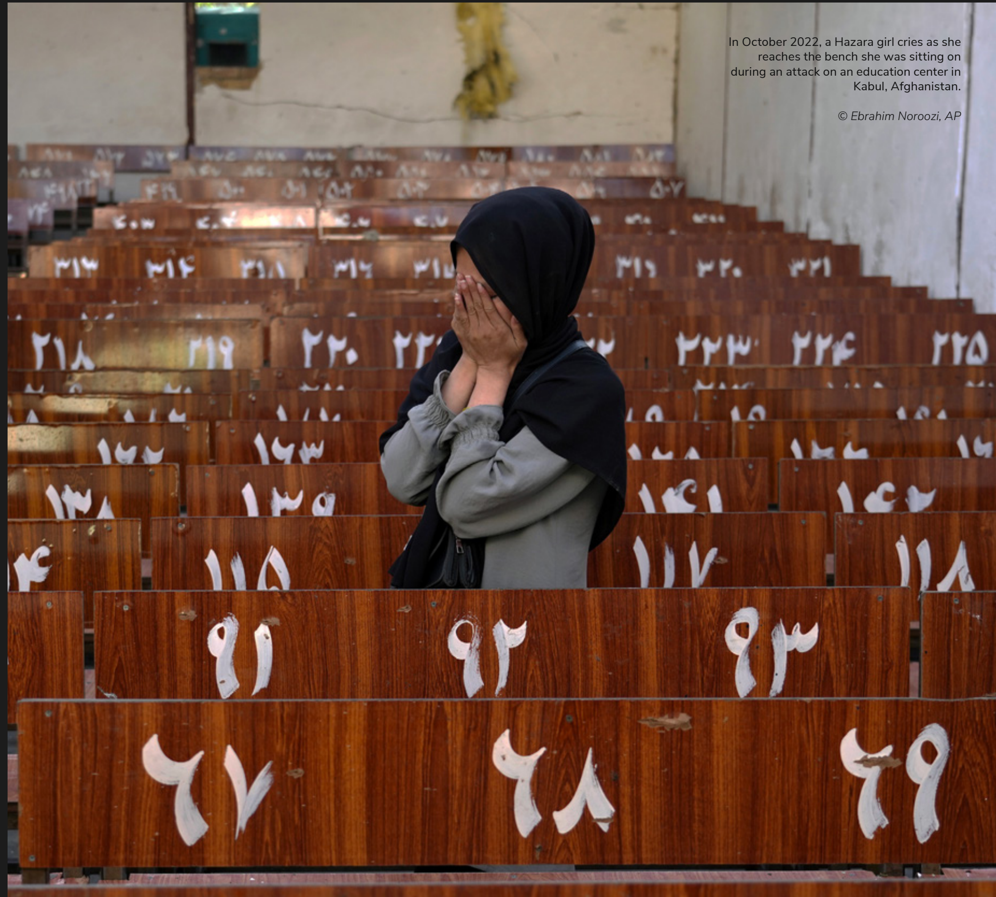
In October 2022, a Hazara girl cries as she reaches the bench she was sitting on during an attack on an education center in Kabul, Afghanistan.

For a full list of recommendations for each commitment of the Safe Schools declaration, tailored to specific actors, see the Education under Attack 2020 report. GCPEA core recommendations are shared below.